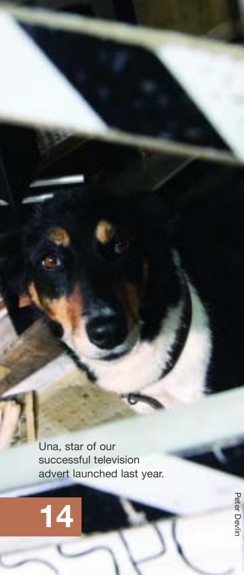
Una, star of our successful television advert launched last year.